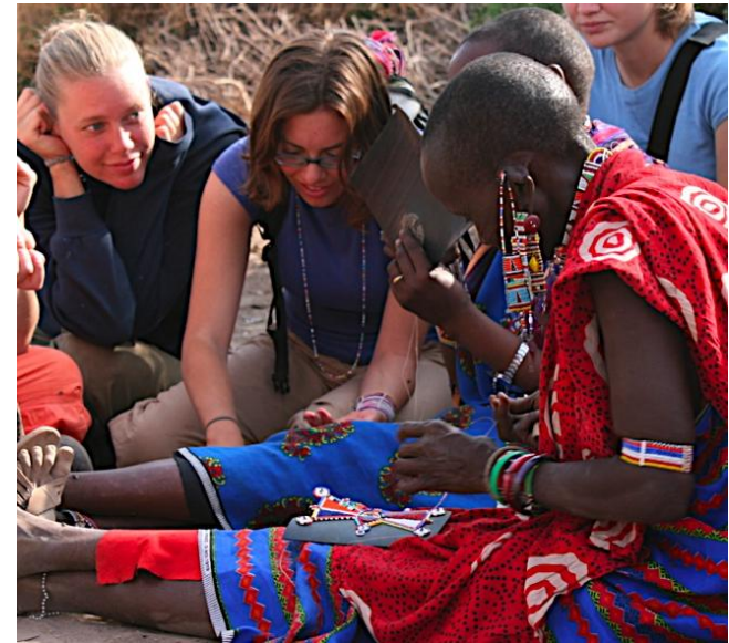
Maasai Jewelry Making

Why visit Enkongu Narok for only an hour when you can spend the whole night? Your Maasai hosts graciously welcome you to sleep on animal skins, milk cows in the morning, and leave with the memories of a lifetime.